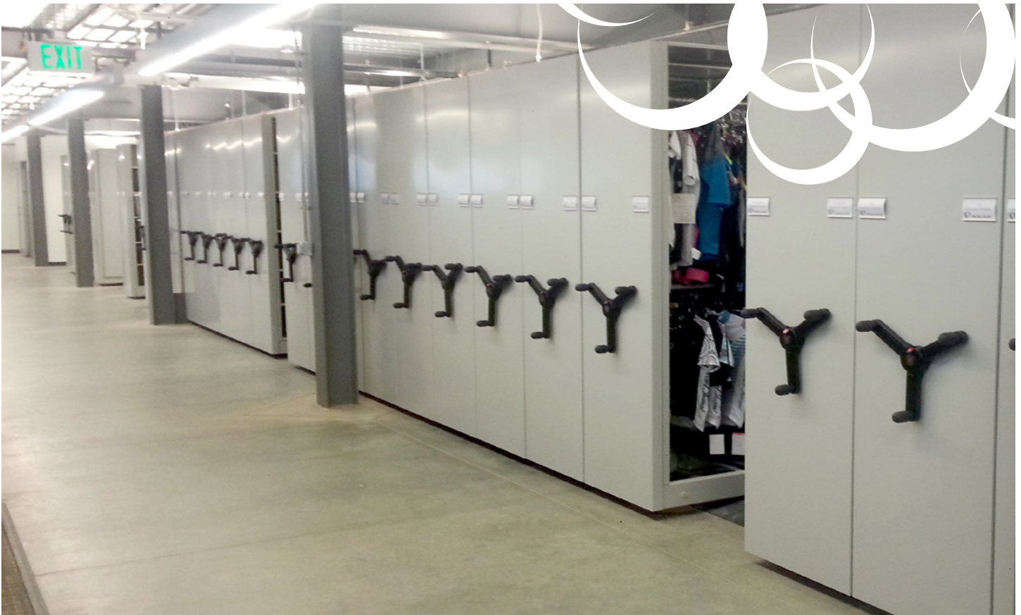
Montel high-density mobile storage gives Pearl Izumi significantly greater storage capacity per square foot of floor space.

To meet Pearl Izumi's functional and operational storage needs with maximum efficiency and quality, for this much anticipated new North American headquarters, the following Montel storage shelving solution & product configurations were supplied: