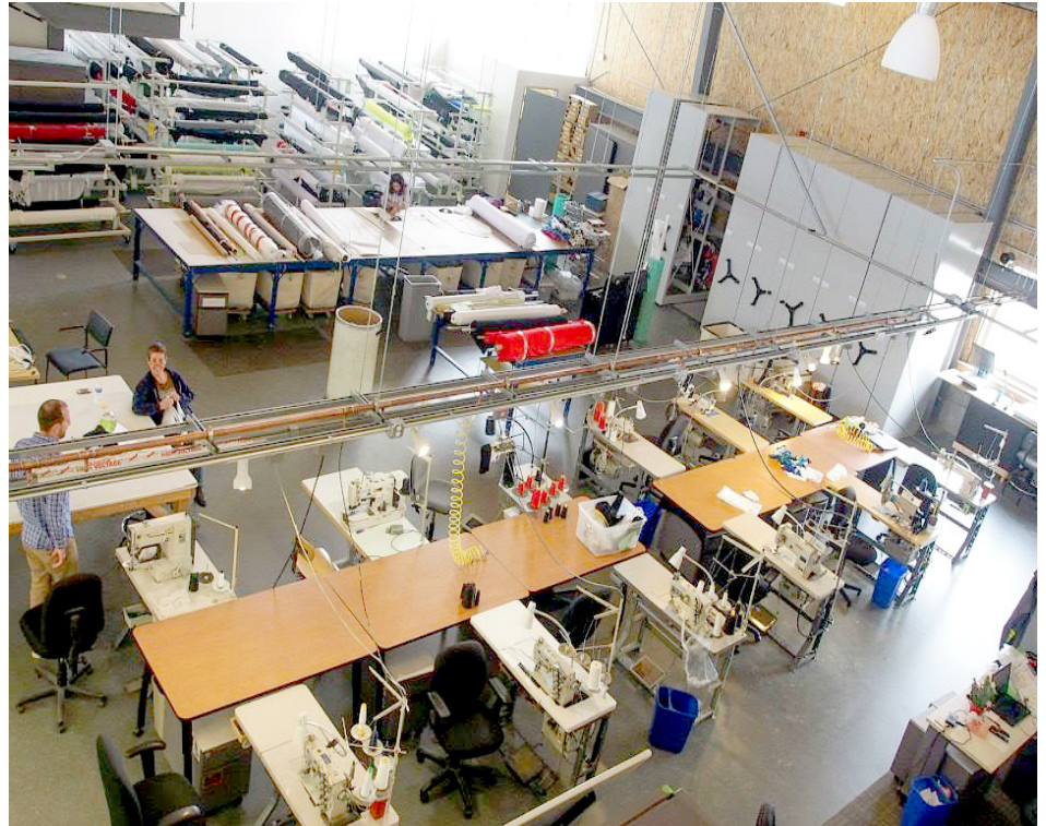
A high-density mobile storage system supporting Pearl Izumi's high-level Advanced Development Team known as The Speed Shop.

To enable further growth and to enhance the productivity of the workplace, which would be visually compelling and, at the same time, highly functional, the new headquarters incorporated centralized storage areas for storing prototypes and developed in-house clothing, supporting the lively creative collaboration that characterizes the company's workstyle.