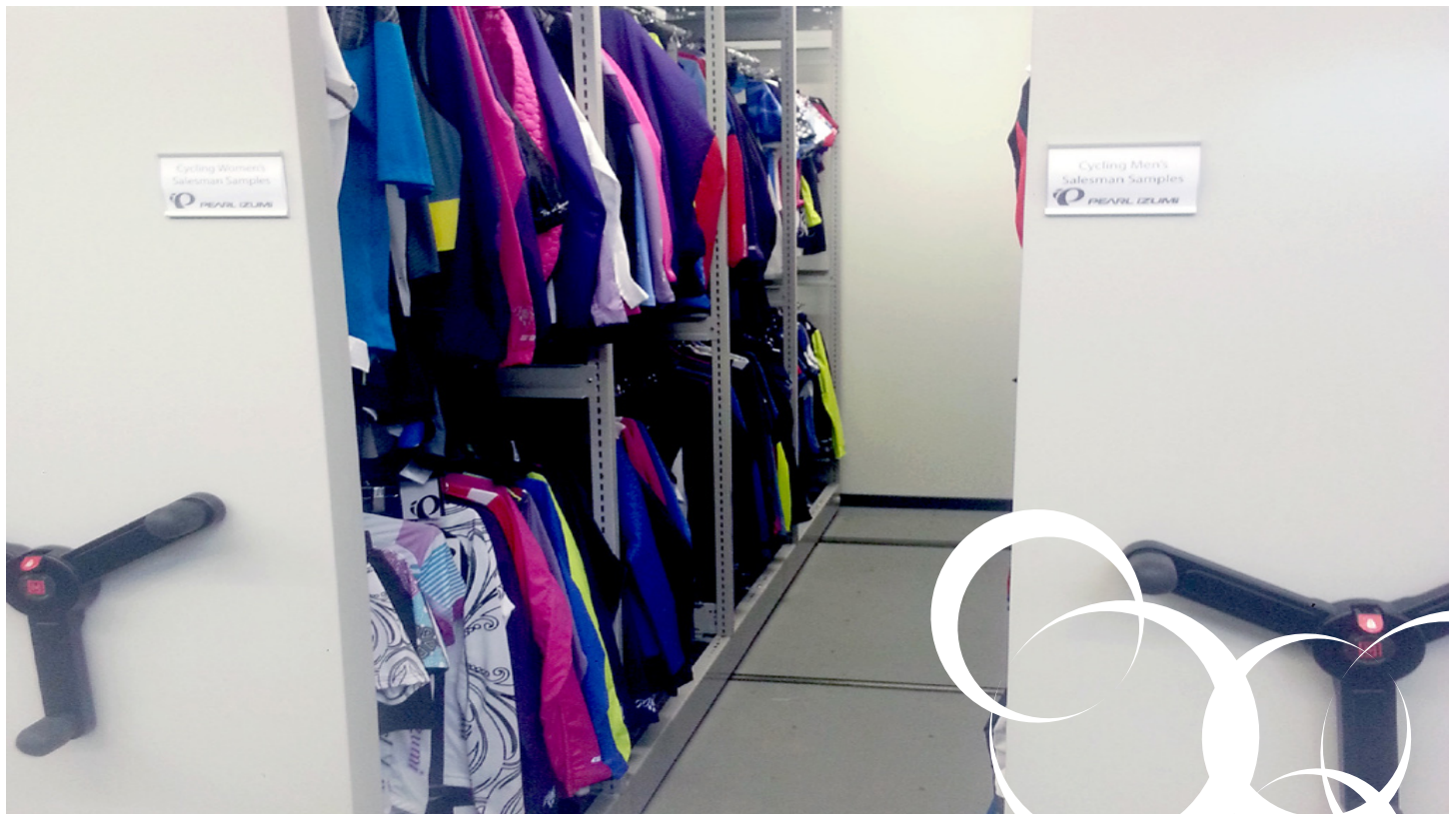
A mechanical-assist mobile storage system accommodating performance cycling apparel samples.