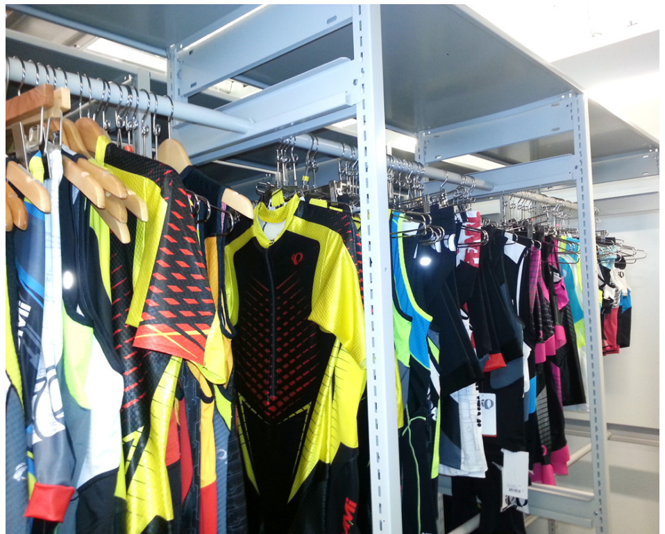
SmartShelf shelving storage units with specialized garment rods housing Pearl Izumi latest apparel products.

Going beyond conventional planning concepts, Pearl Izumi's design team focused on the spatial organization for housing portfolio samples of its leading edge clothing and footwear. Demonstrating and promoting green design strategies, efforts to reduce environmental footprint, improve sustainable workspaces, and reduce operating costs were predominant design objectives for this brand new state-of-the-art building.