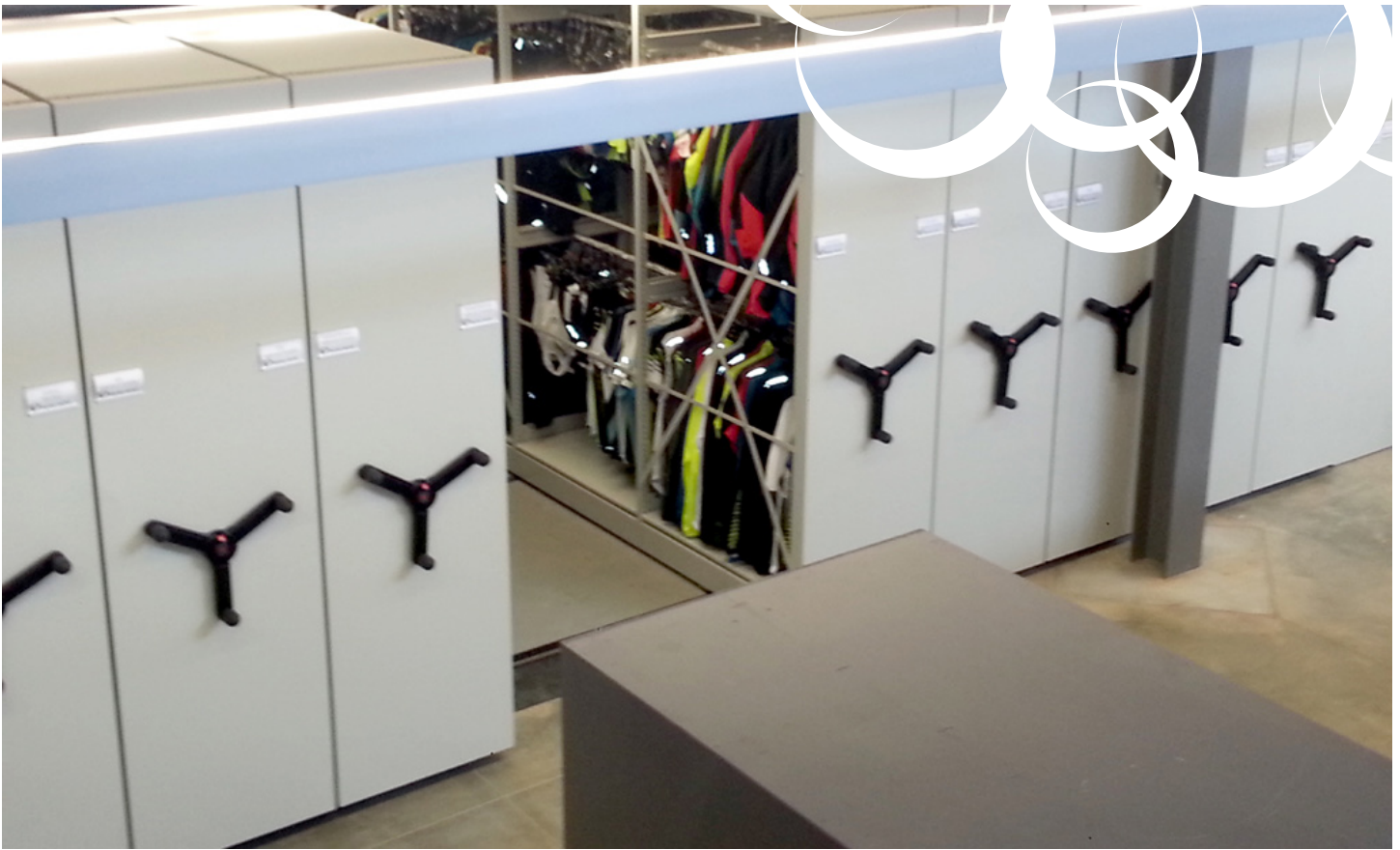
Montel's centralized compact storage solution successfully achieved several key design objectives.

Going beyond conventional planning concepts, Pearl Izumi's design team focused on the spatial organization for housing portfolio samples of its leading edge clothing and footwear. Demonstrating and promoting green design strategies, efforts to reduce environmental footprint, improve sustainable workspaces, and reduce operating costs were predominant design objectives for this brand new state-of-the-art building.